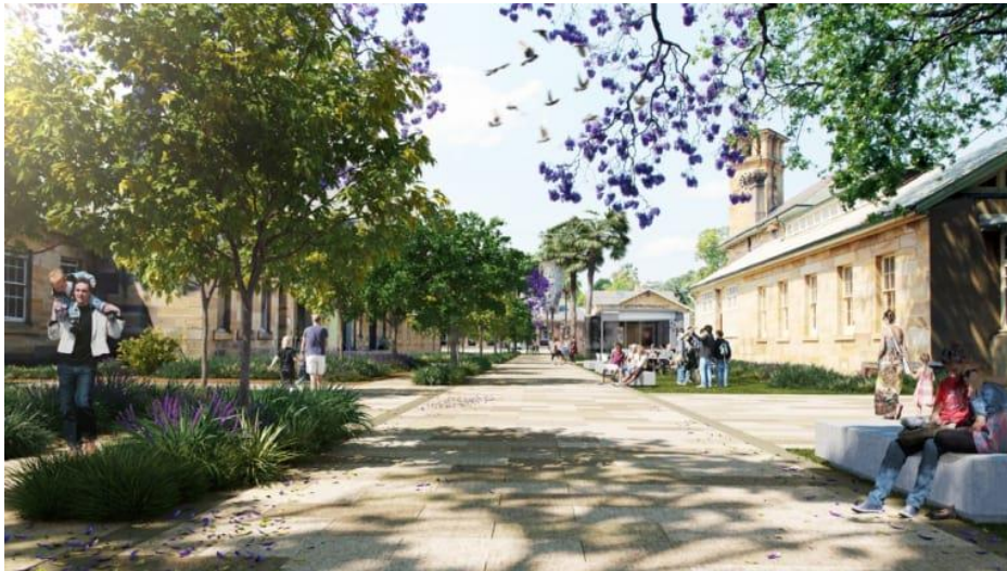
An artist's impression of the North Parramatta heritage precinct redevelopment