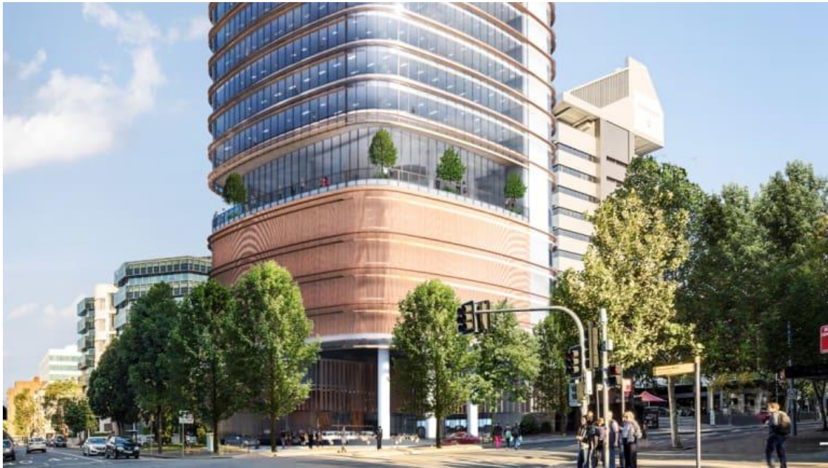
32 Smith St Parramatta

New developments in Parramatta: GPT Group has signed a head of agreement with the insurer QBE to be the anchor tenant for its new $300 million office tower at Parramatta. This is part of the $10b of development of the City planned for the next two years. Located at 32 Smith Street, the 26,000 square metre building will feature ground-level 'urban room' event space, an elevated podium terrace facing the Parramatta river, and a car park that can be converted into office space in the future. Completion for the development targeted by late 2020.